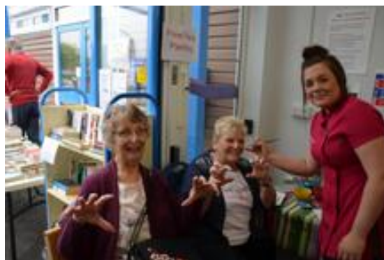
Adults joining in the fun at the face painting on our Community Day