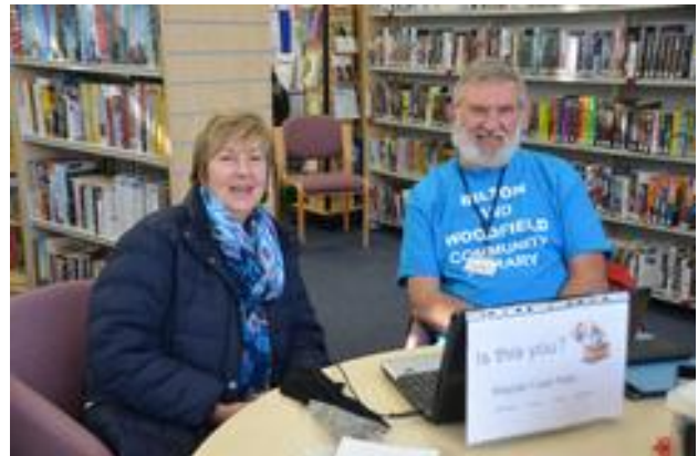
Enjoying a coffee at one of our coffee mornings and using our IT helpdesk