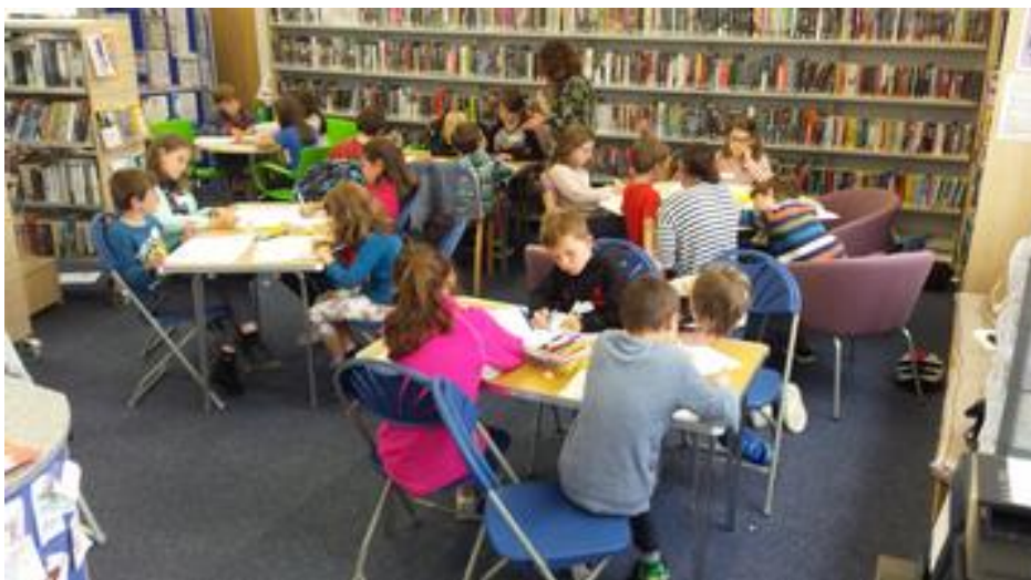
One of our Creative Writing workshops

Thank you to everyone who has donated their time or money to help keep Bilton and Woodfield Community Library Open and providing a service to our local community.