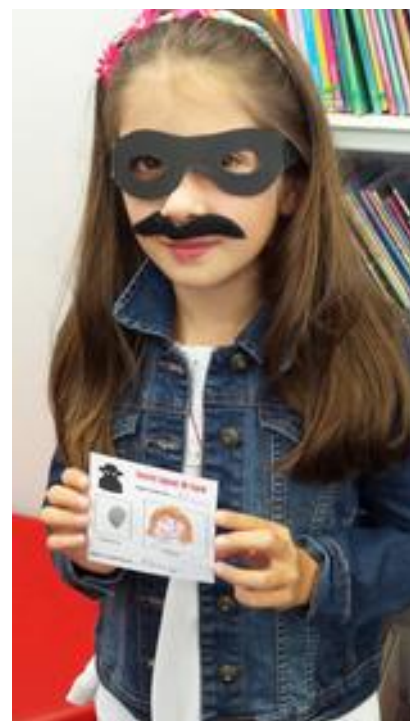
A set of 'dodgy' characters

One of our volunteers is the Library's School Liaison and contacts and visits all the primary schools (8) in our area to promote and encourage reading and library use. Since we became a Community Library over 1400 children have made class visits with their schools when the library is normally closed. An amazing number by anyone's standards.